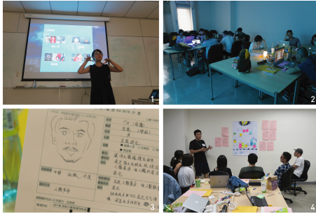
Figure 4: Details of Workshop